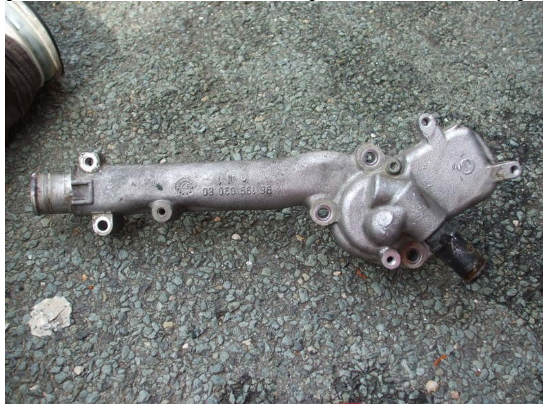
There is however, a black bar on the underside of the Thermo casing towards the back of the engine. It holds a bar on. I bent mine back with a screwdriver. Its important to get this off as on of the main bolts that holds the casing on, is UNDERNEATH this. So it has to come off!

Once the hoses are disconnected water will flow! There will be about 4 litres come out! After this start taking off the bolts. There are 3 on the main casing, one at the bottom of the casing near the radiator. There is also a cable holding plate at the top of the housing that need to come off. There are 2 bolts holding this on. Mine was black. Unplug the connector too!!