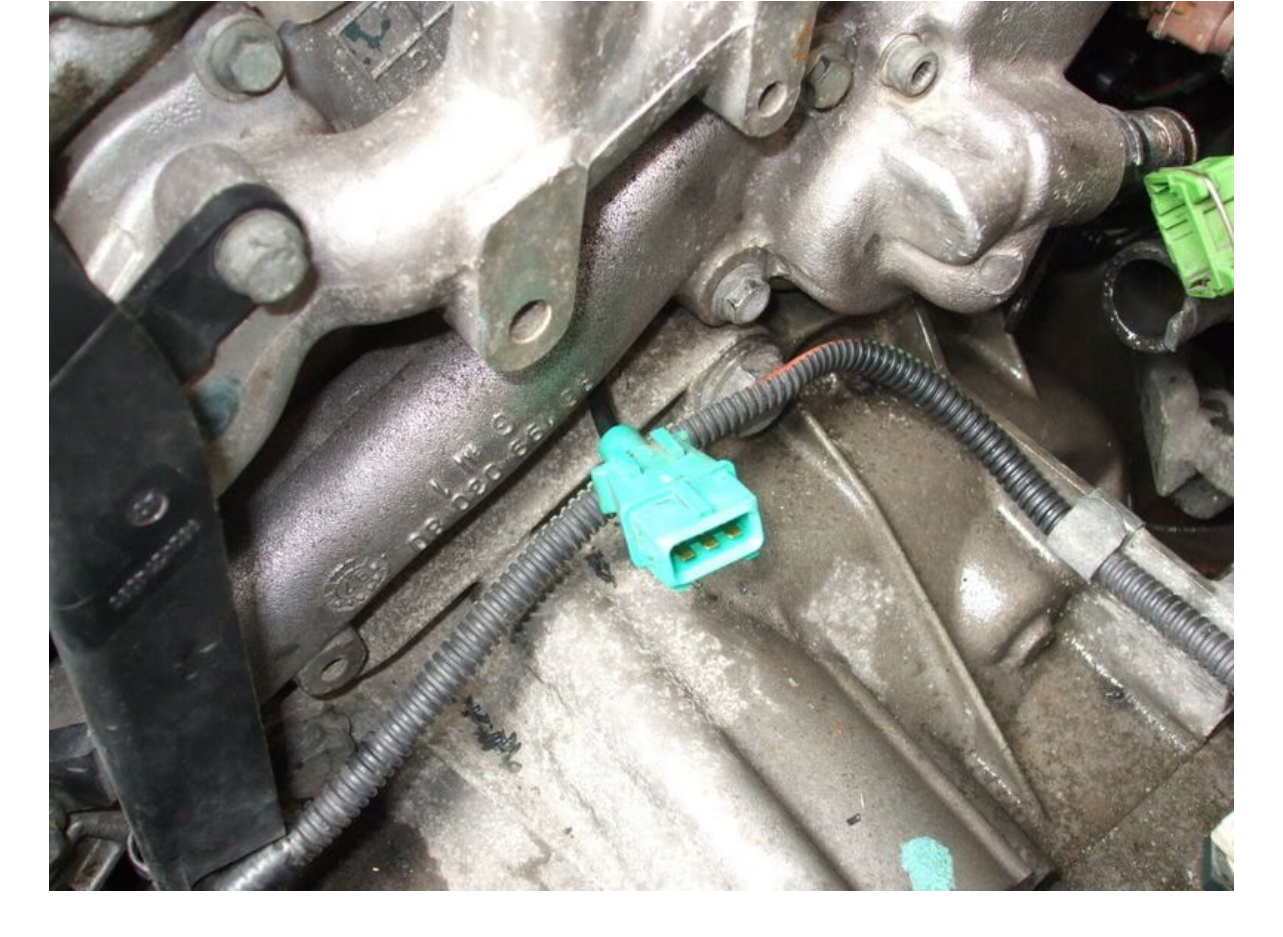
If is turns out short, you will have to take the casing off again!!! I had to! DOH!

Right, after all the bolts are tight, green conector connected, hoses in place and tightened you are ready for bleeding.