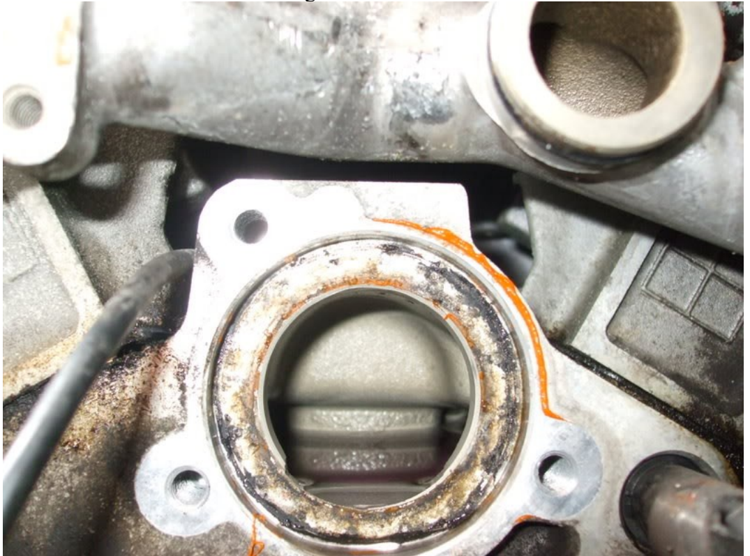
I gave both sides a good clean and where the seal sits a very thin coat of liquid gasket....