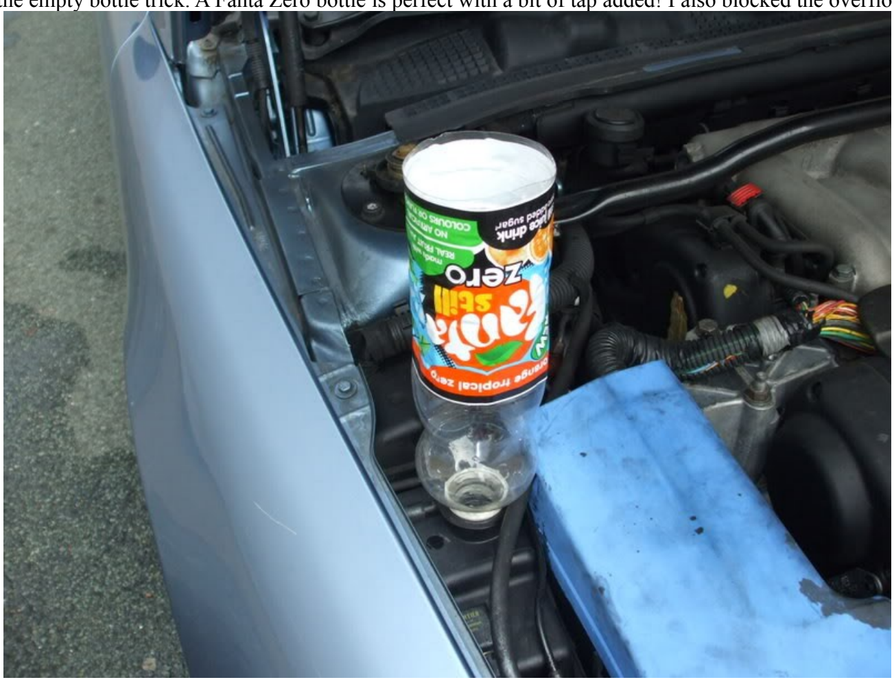
Provided by 406 Coupe Club There are 4 bleed points on the D8 V6. http://www.406coupeclub.org One is on the radiator itself on the right hand side. This needs turned quarter of a turn to open/shut.

I used the empty bottle trick. A Fanta Zero bottle is perfect with a bit of tap added! I also blocked the overflow pipe.