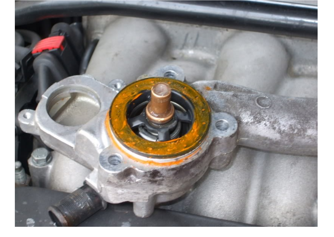
Place you seal in and give it a bit of a light tap to make sure its in. You will know when its in.

Basically refitting is a reversal of removal. Don't forget the bolt at the bottom of the casing UNDER where the black rod goes and don't forget the bold UNDER the plastic cable holding at the front of the engine. These two are important as they hold the casing to the engine.