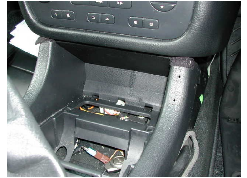
Carefully pull floor console upwards from rear end, and push front end down. Carefully pull floor console towards rear of car, being very careful for wires connected to cigar lighter. When there is sufficient clearance, unplug cigar lighter and fully remove floor console.