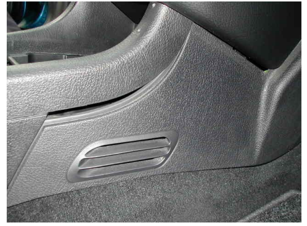
Carefully pull side trims away from floor console, being careful for any vent ducts attached.