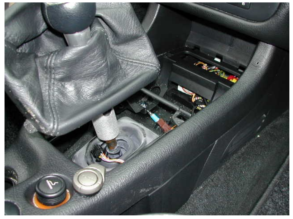
Open ash try and gently pull ash tray complete and surrounding trim away, gear lever gaiter will now also gently pull away