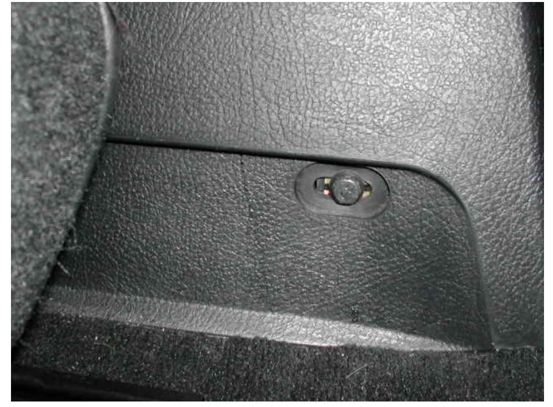
Remove bolts (10mm) from both sides at the rear of floor console (either side of rear ash tray).