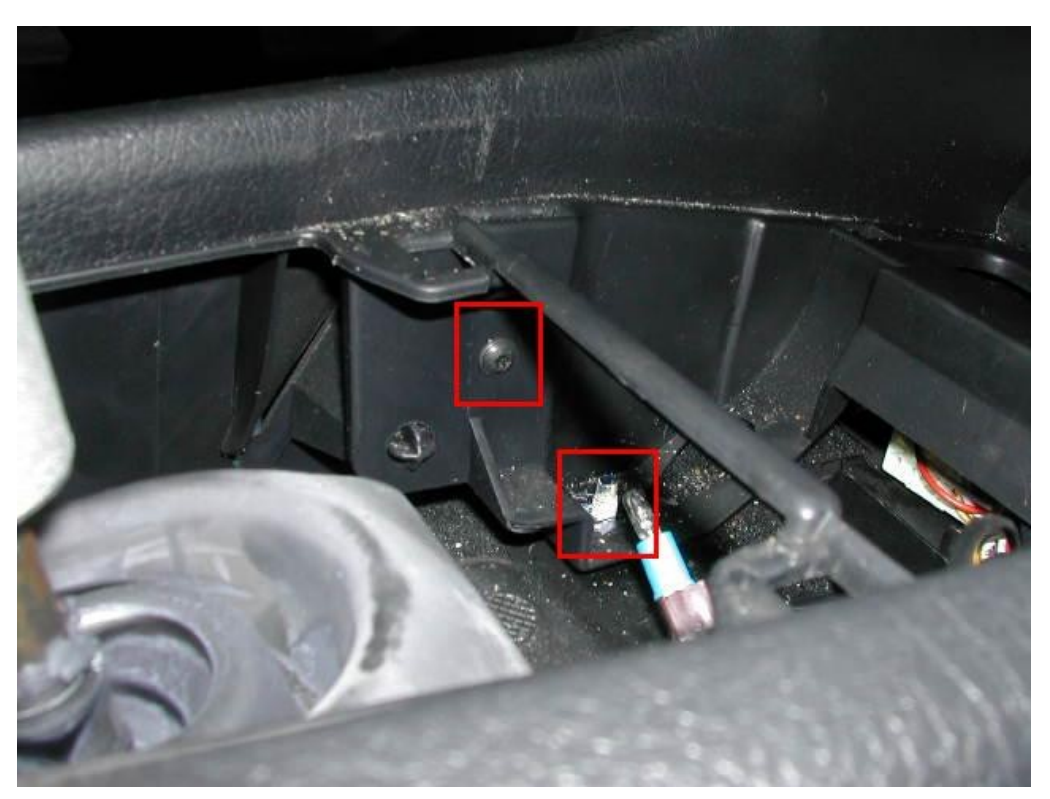
Remove 2 x screws (T20) and nuts (10mm)