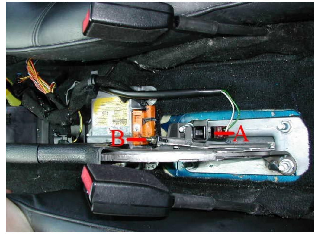
Remove nut (10mm) from handbrake cable (B) and pull up hand brake. Remove connector from handbrake switch (A) then unclip switch and remove it.