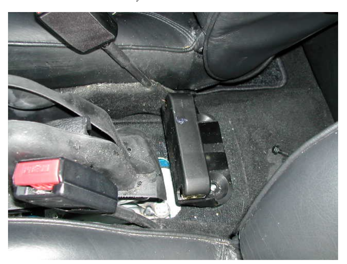
Gently pull handbrake rubber boot away from lever.