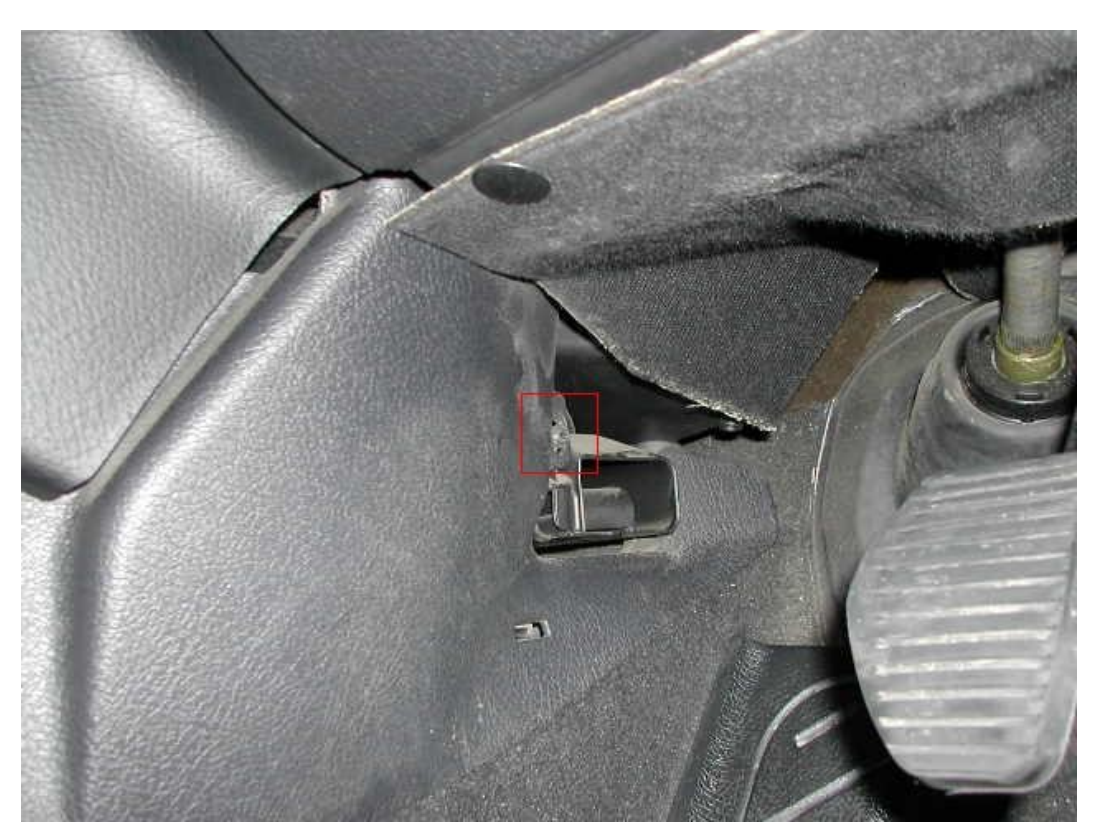
Remove screws from trims on both sides at front end of floor console (in foot wells)