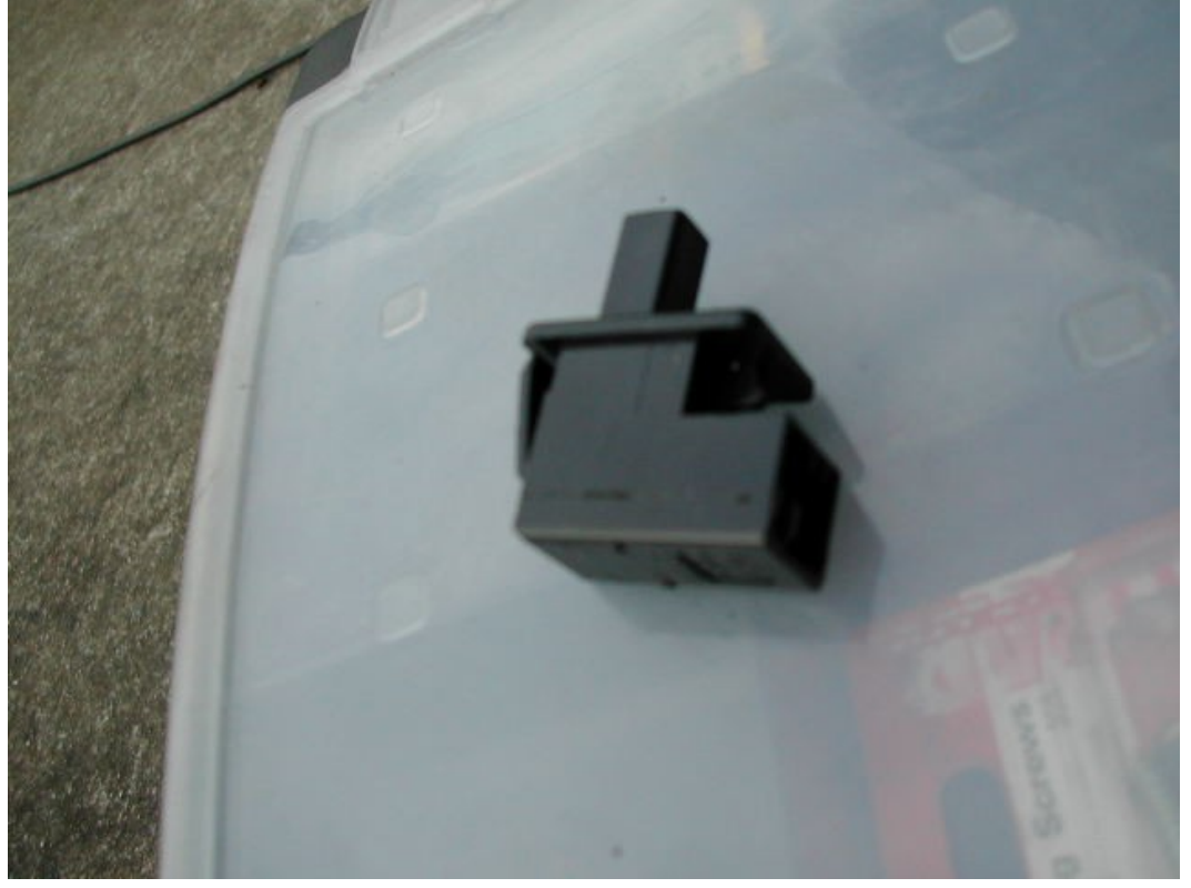
New handbrake switch