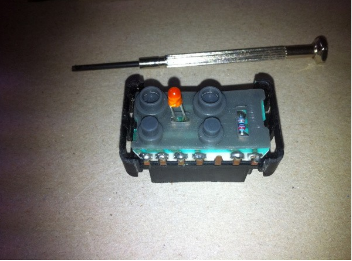
New LED + Resistor