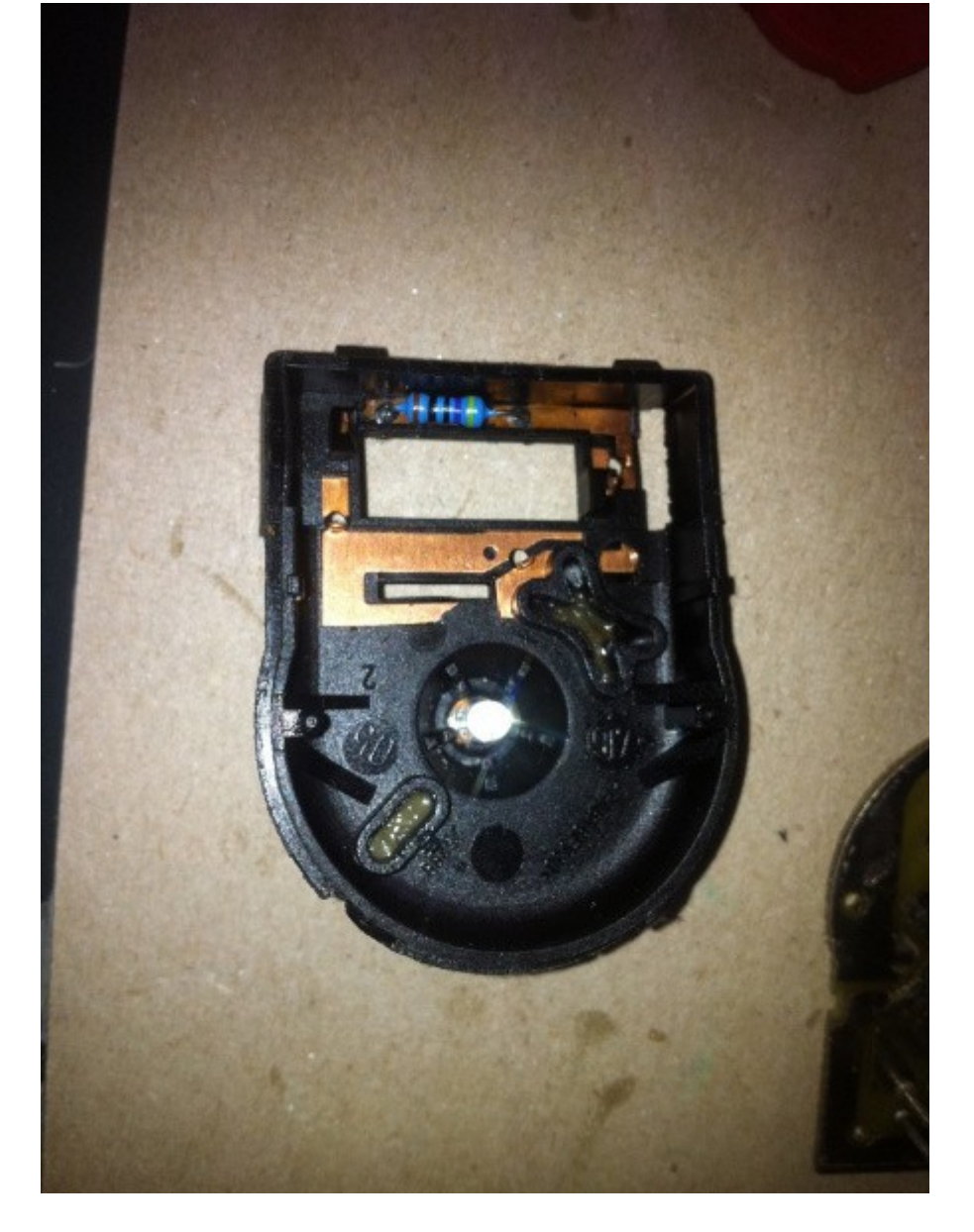
Step 7: Put Mirror Switch back together, making sure that the red part on the circuit board fits in the black groves of the black base: