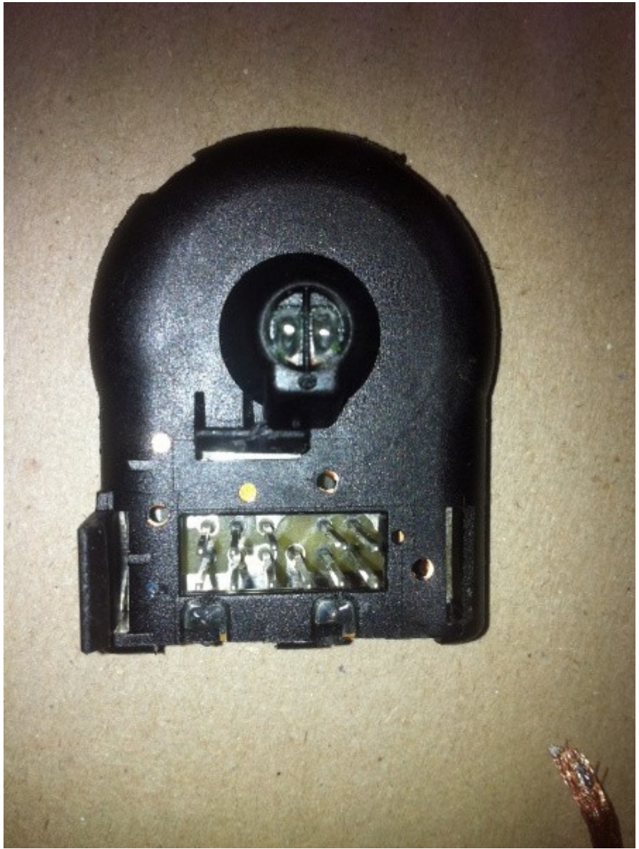
Then Remove black base from circiut board: