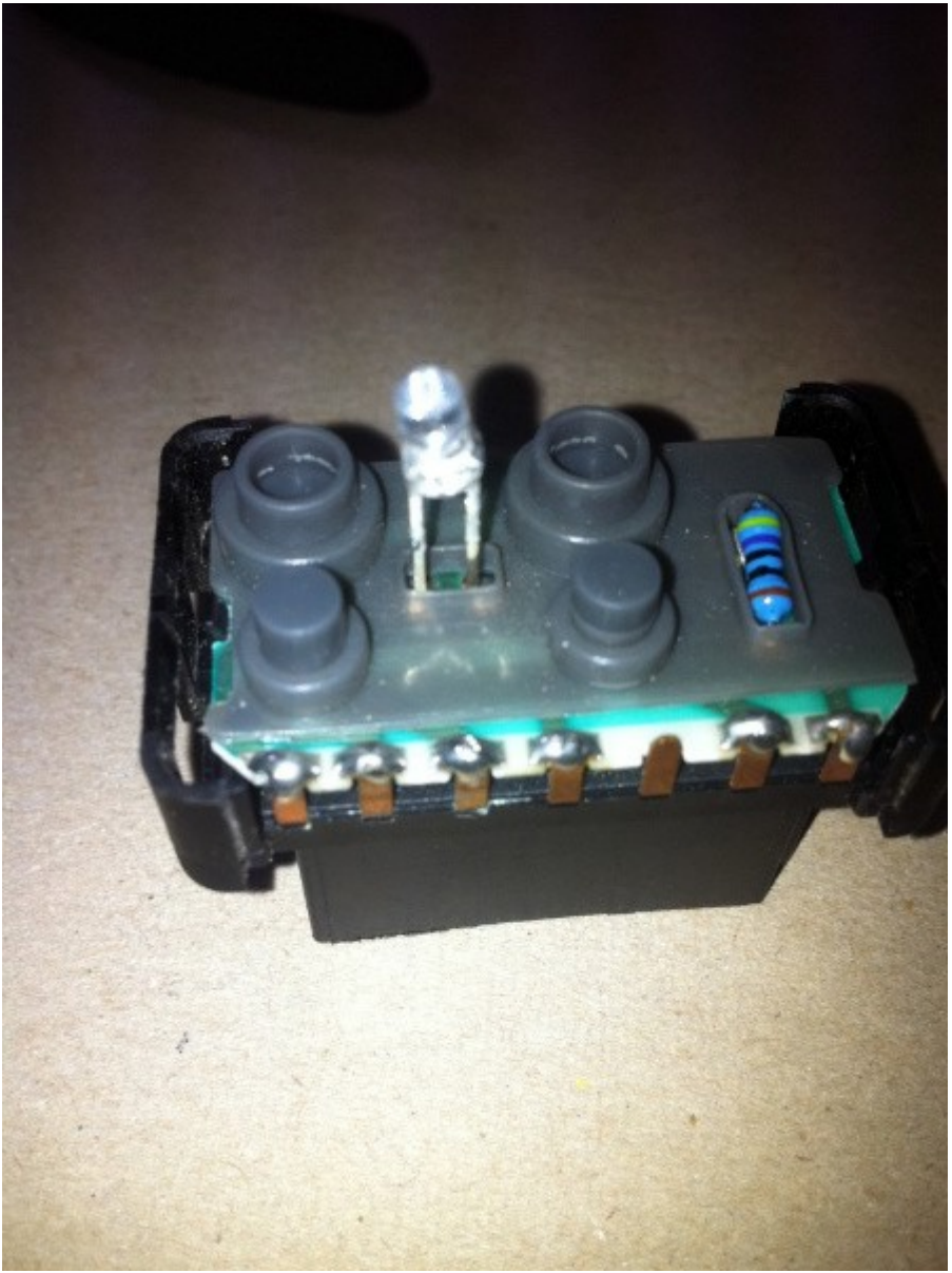
Then Put Switch Back together