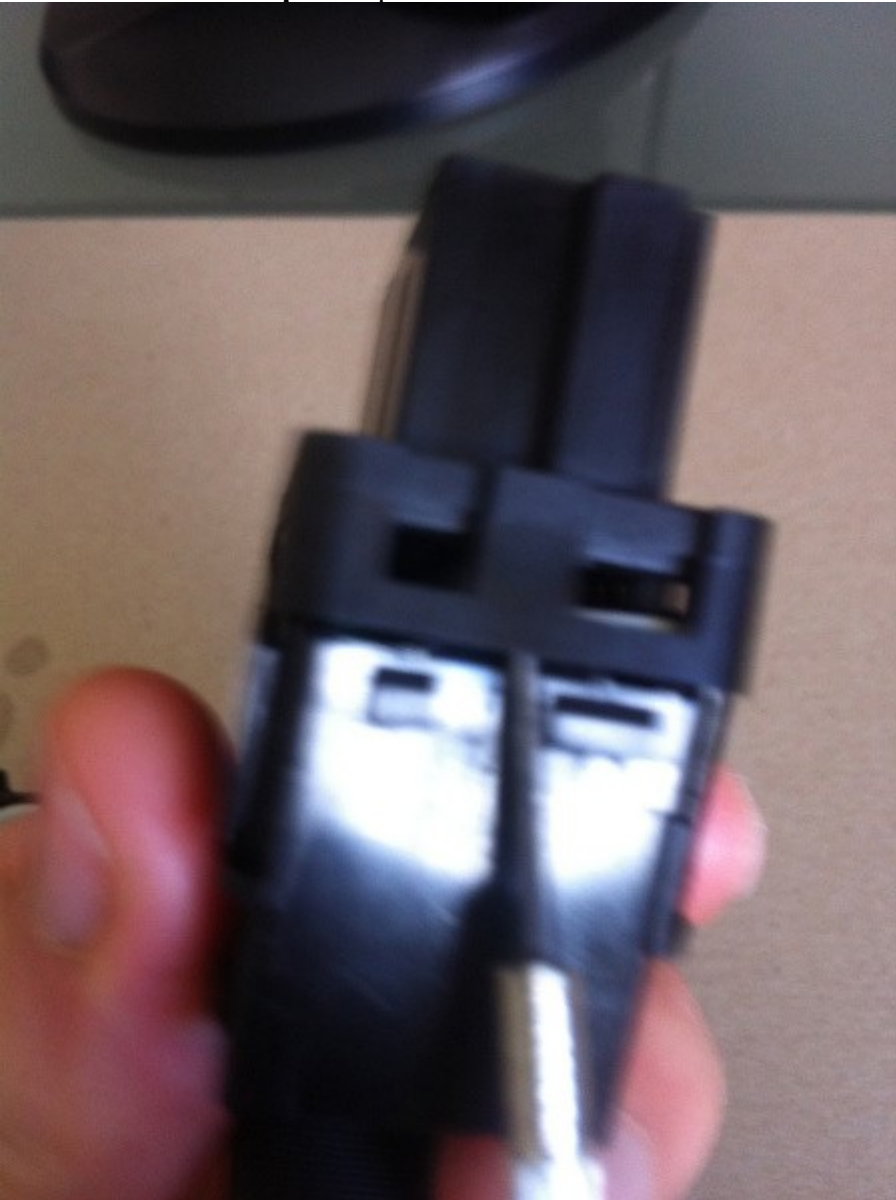
Once again using a small screw driver to pry open the clips.

Step 4: Replace LEDs + Resistor The Original Circut Board (Note that the smaller rubber circles are near the solder marks.)