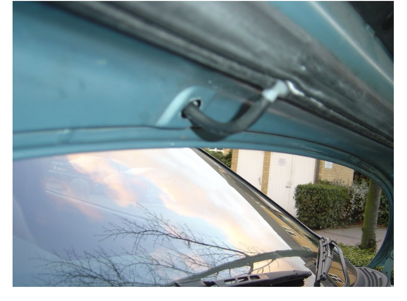
Repeat for the other side and voila: