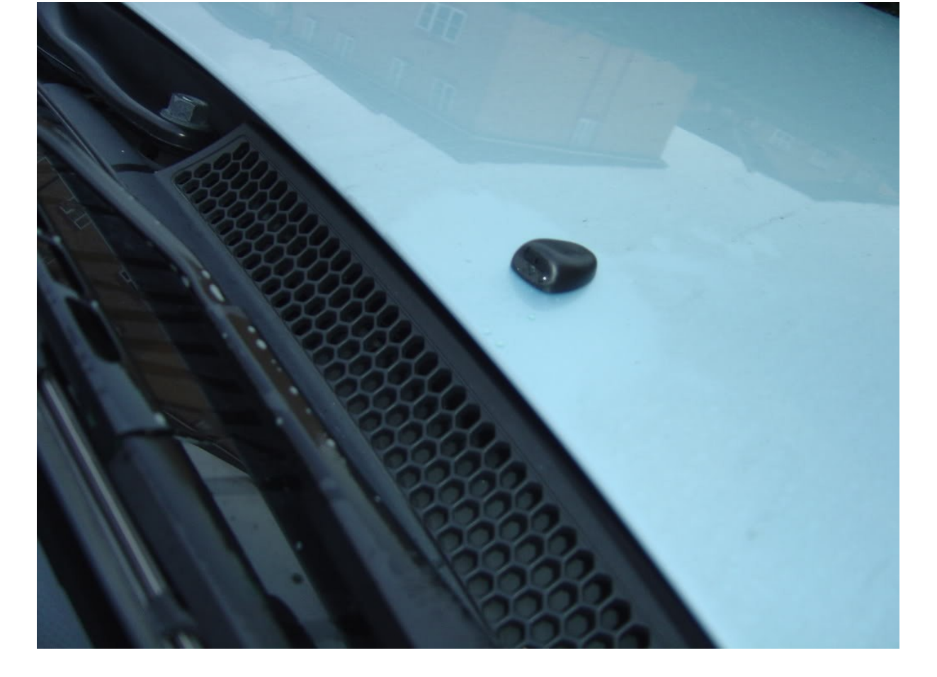
The jet covers the windscreen a treat: